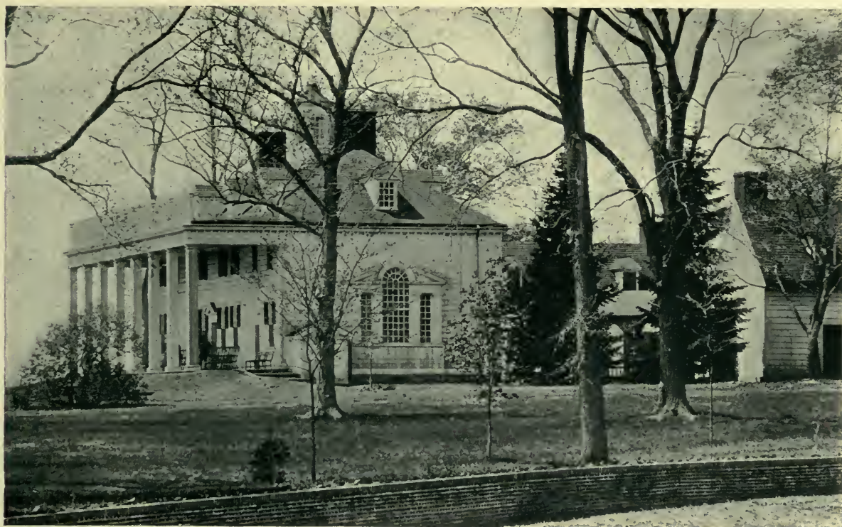
MOUNT VERNON MANSION, FAIRFAX COUNTY, VIRGINIA

Probably the most notable of Virginia plantations, the home of George Washington